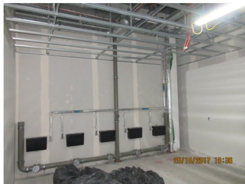
2 nd Floor Toilets in being progress in readiness for IPS