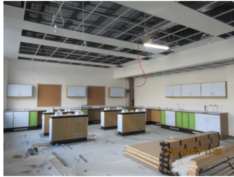
3 rd Floor Fit out of science laboratory