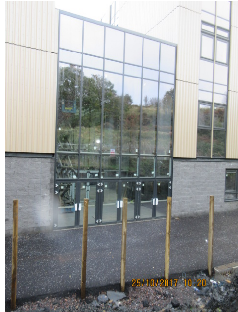
Main School Entrance