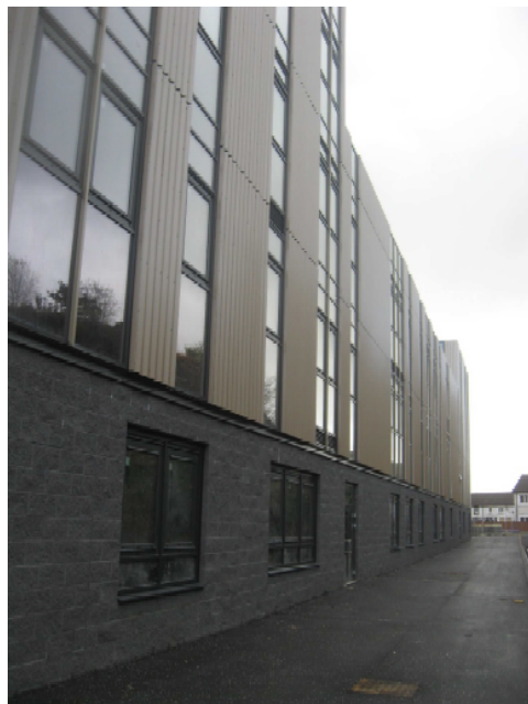
North Elevation looking towards McCall Terrace