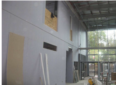
Partition installation in the main entrance foyer