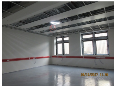
2 nd Floor - Preparation works for the vinyl flooring