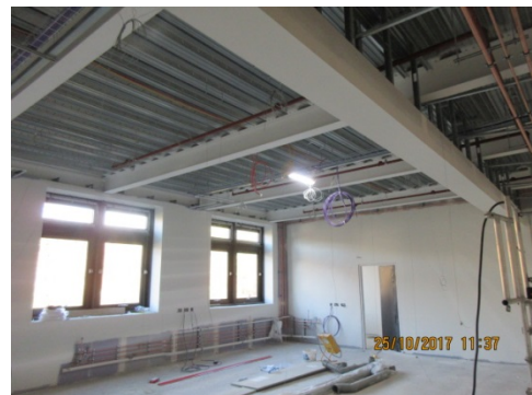
2 nd Floor - services being installed