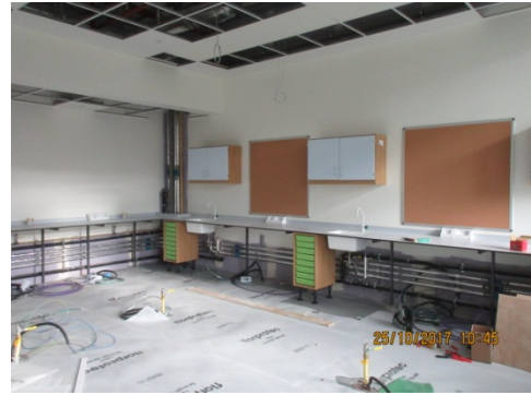
3 rd Floor Fit out of science laboratory