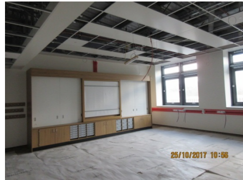
3 rd Floor - Teaching wall installation in Maths classroom