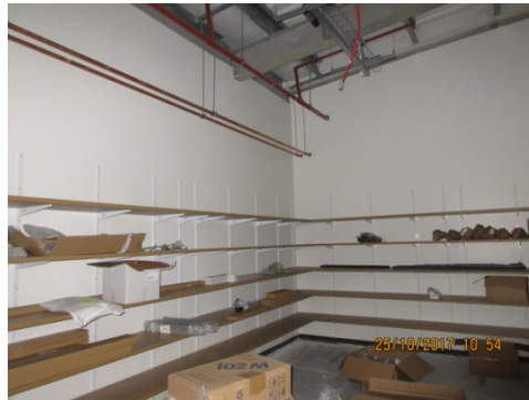
3 rd Floor - Maths storage room