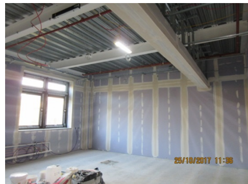
1 st Floor Tape and jointing works ongoing