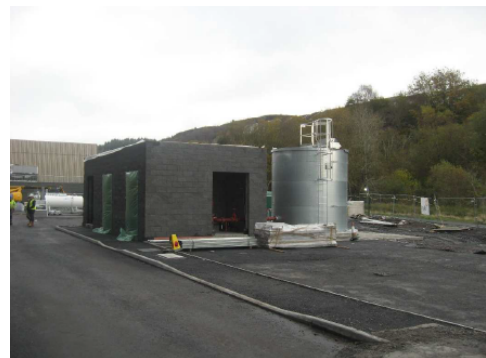
External pump room and sprinkler tank